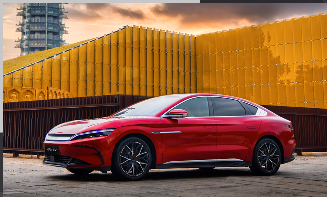
NEDC driving range