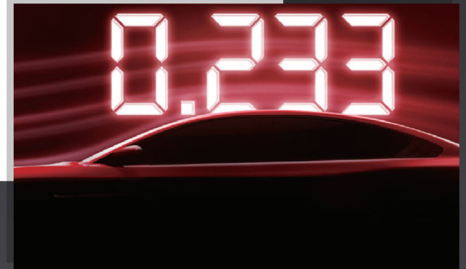
Ultralow drag coefficient