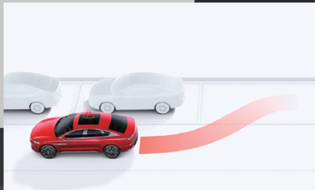
Intelligent driving assistance systems