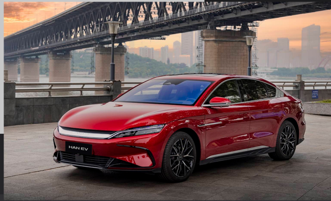
0 to 100 km/h acceleration