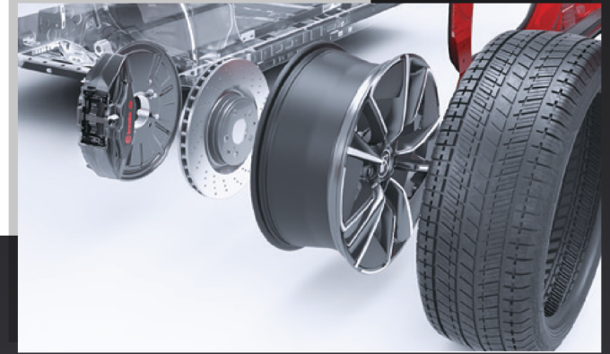
100km/h to 0 Braking distance